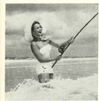
Fishing is fine on Florida's beaches