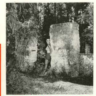
Moderns explore old "Tabby" slave quarters