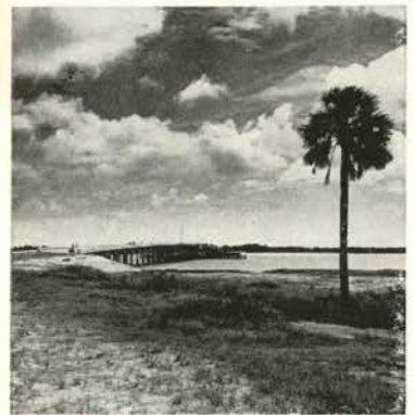
One of five modern bridges on the route