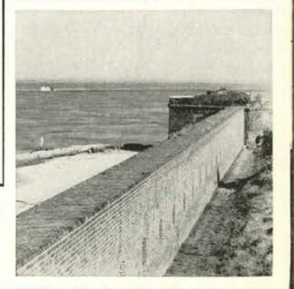
Old Fort Clinch at Fort Clinch State Park