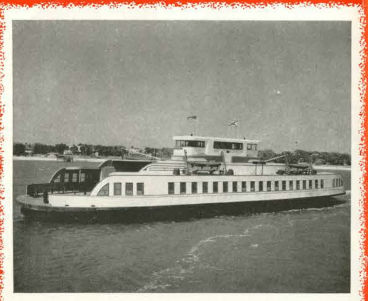
"THE BUCCANEER" MAKES A RUN

From Fernandina Beach, the route of THE BUCCANEER TRAIL south, over Fla. AlA, is via Mayport, Atlantic Beach, Jacksonville Beach, Ponte Vedra Beach, St. Augustine, Marineland, Ellinor Village and Daytona Beach, on to the fabulous resort areas of South Florida.