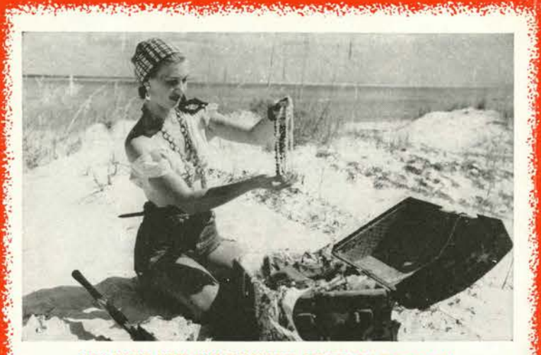
YOU MIGHT MEET THIS BUCCANEER BEAUTY ON THE BEACH

otorists southbound for a Florida vacation now turn left on Fla. AlA, "THE BUCCANEER TRAIL", shortly after crossing the Florida line. Then, by-passing Jacksonville's congested traffic, they glide swiftly down the northeast Florida coast, over a magnificent new ocean shore highway through a region rich in romance, history, and picturesque beauty. THE BUCCANEER TRAIL, which is Fla. AlA, leaves US 17,