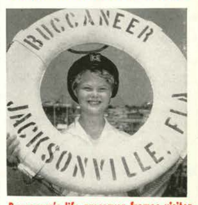
Buccaneer's life preserver frames visitor