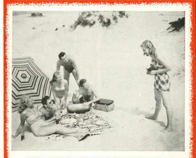
CAMERAS RECORD PLEASANT PAUSES ALONG THE BUCCANEER TRAIL

A visit to historic Fort Clinch, near Fernandina Beach, marks the beginning of a memorable trip southbound on THE BUCCANEER TRAIL. Here in its interesting museum, the only one owned and operated by the Florida Board of Parks and Historical Memorials, are seen many reminders of the eight flags that have flown over Amelia Island since 1562. Fort Clinch State Park is the largest historic site in state ownership.