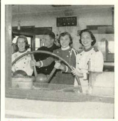
Lovely visitors take a turn at the wheel